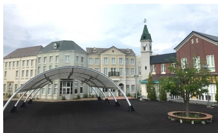
TEPCO Decommissioning Archive Center (Renovated Former Energy Museum)