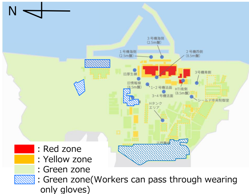
Fig.1. Zone layout at the Power Station