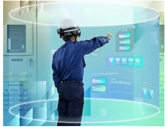
New user interface simplifies working in a MR world