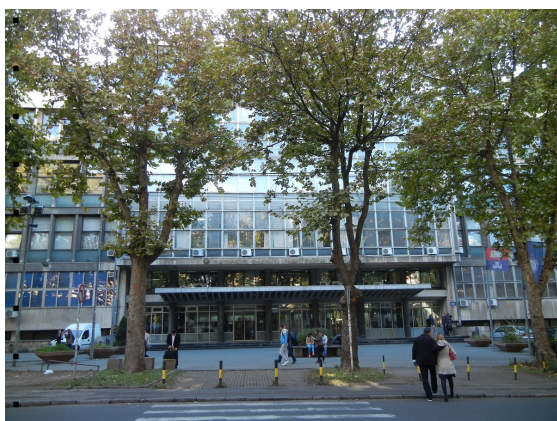
Overview of the Center in Belgrade University