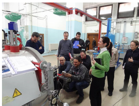
Training for Instructors by Training Facilities