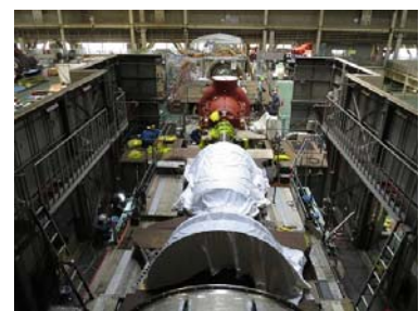
Disassembling of gas turbine equipment

*For equipment countermeasures for fuel cost reduction in thermal power station, please see the