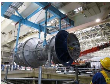
Lifting of the body of new gas turbine equipment

<Picture of replacement work of gas turbine (Replacement of Unit 2 at Group 7)>