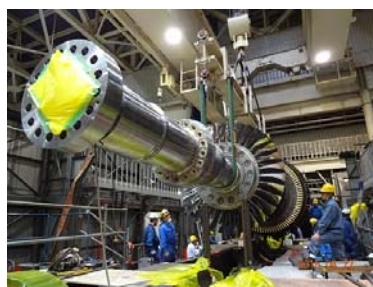
Lifting of new gas turbine equipment (Rotor)