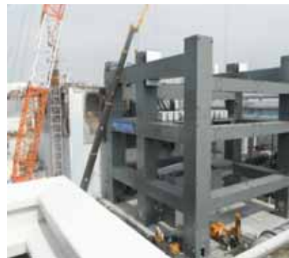
Upper left: Fukushima Daiichi NPS Unit 3 Reactor Building outer appearance (March 15, 2011 )