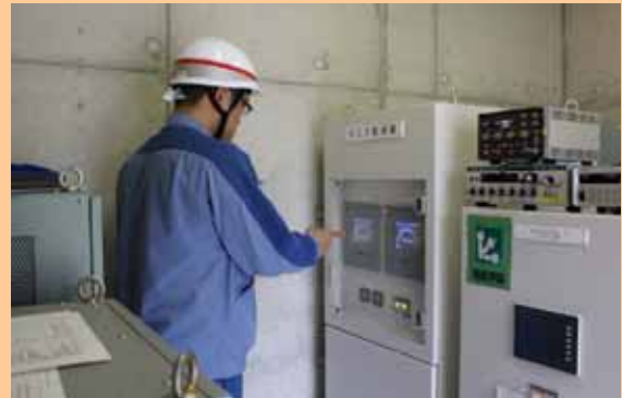
Check the measurement values on the monitoring panel.