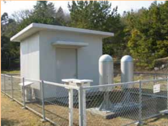
1. MP-7 before the earthquake (Photo taken on March 17, 2004)

Since MP-7 was washed away by the Tsunami, measurement utilizing a portable monitoring post was started on March 21, 2011. Detectors were then installed and measurement utilizing a temporary monitoring post was started on June 13, 2011. The permanent installation was completed on December 21, 2011 allowing for measurement by the new monitoring post.