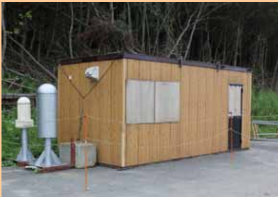
3. Temporary MP-7 (Photo taken on August 26, 2011) Measurement utilizing the temporary monitoring post was started on June 13, 2011.