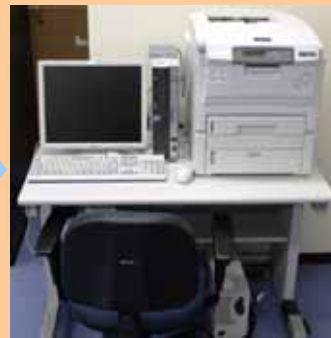
Data collection/processing system