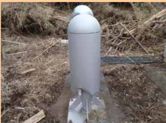
3. Detector after debris removal (Photo taken on April 4, 2011)

Removed the debris brought by the Tsunami.