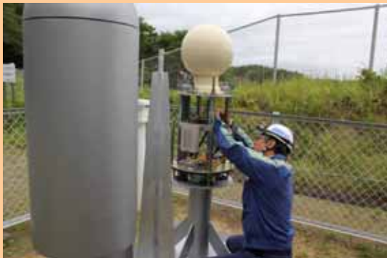
Cleaning the inside of the monitoring post

Remove the cover from the monitoring post and clean the inside of it.