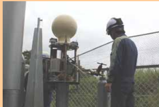
Nitrogen gas injection

Inject nitrogen gas in order to maintain the consistent humidity level inside the container storing the detector and ensure the detector accuracy.