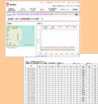
TEPCO home page