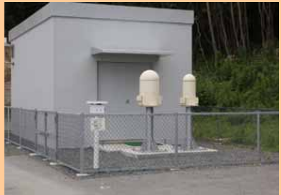
4. Newly installed MP-7 (Photo taken on July 24, 2012) The permanent installation was completed on December 21, 2011.