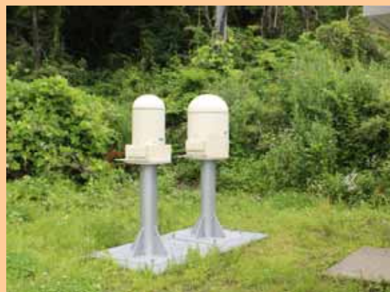
3. Replacement of detectors, etc. (Photo taken on July 23, 2012)

The radiation environment surrounding the detector was changed as a result of debris removal, and MP-6 measurement values went down.