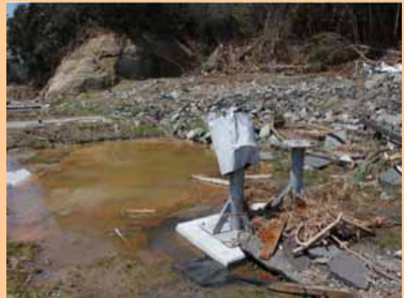
2. The detectors and the building washed away by the Tsunami (Photo taken on April 24, 2011)