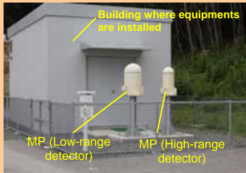
MP-7 (Photo taken on July 24, 2012)

A “low-range detector” measuring low radiation dose and a “high-range detector” capable of measuring high radiation dose are installed for each monitoring post. Equipments used to convert the detected radiation to radiation dose rate are installed in the building near the detectors. The air dose rate measurement results acquired with the monitoring posts are collected, recorded, summarized and analyzed by the data collection/processing system located in the Main Anti-earthquake Building, and are available on our home page.