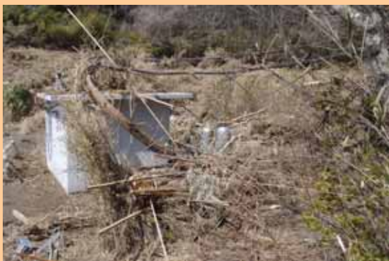
1. MP-6 after the earthquake (Photo taken on April 3, 2011)

MP-6 was capable of measurement even after the detectors, control panel and the equipments installed in the building were partially exposed to the Tsunami, as the soundness of equipments was maintained. The equipments were replaced from October 11 to 21, 2011, for the purpose of preventive maintenance.