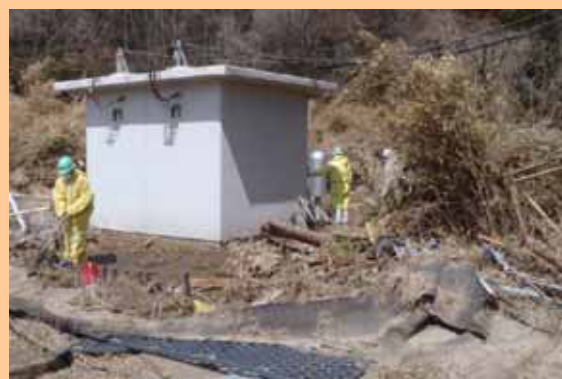
2. Debris removal

The detectors and equipments installed in the building were partially exposed to the Tsunami.