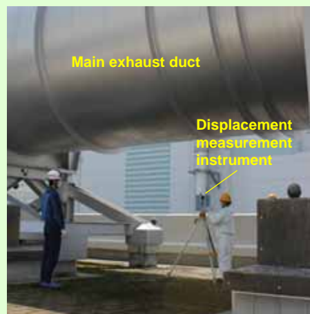
4. Displacement measurement done on the main exhaust duct from April 19 to 26, 2012 (Photo taken on April 24, 2012)