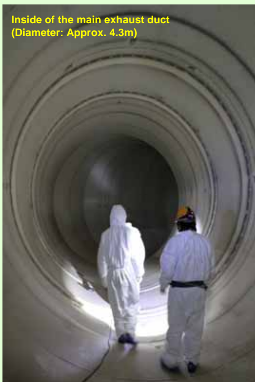
3. Inspecting the inside of the main exhaust duct (Photo taken on April 5, 2012)