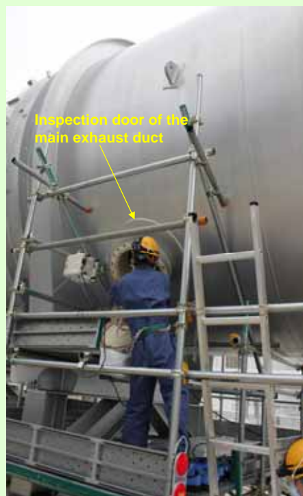
2. Inspection door of the main exhaust duct (Photo taken on April 5)