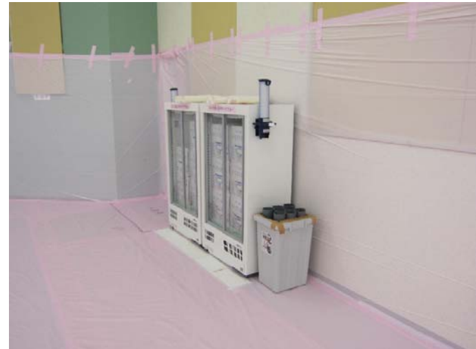
Photo : June 9, 2011 approx. 3:00PM Place : Inside Rest Area (Drinkable Water Machine)