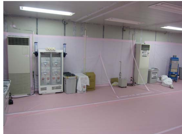
Date of photo : May 19, 2011 around 1:00PM Place :Facilities in Rest Area (drinkable water in 2nd from left side is, local exhauster on right side, dust sampler on left side of right air conditioner