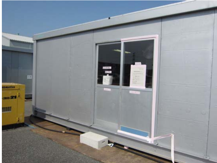
Date of photo : May 19, 2011 around 1:00PM Place :Doorway of Rest Area