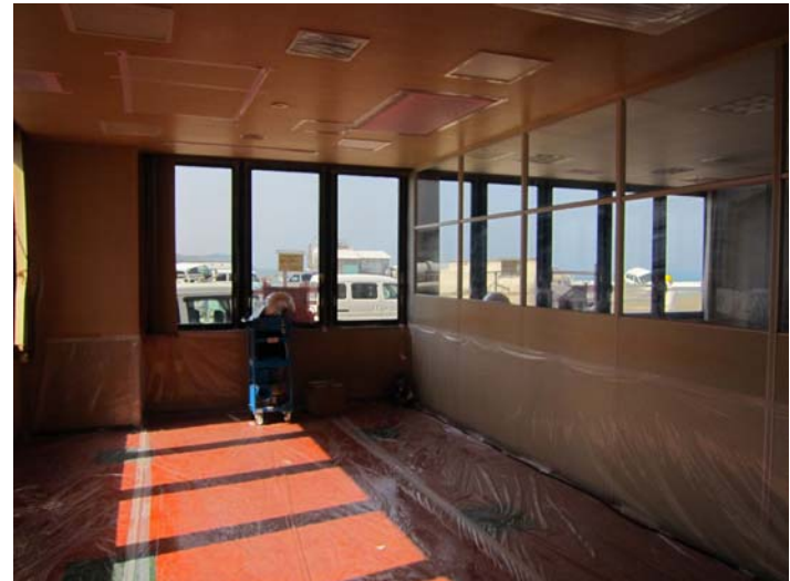
Date of photo : May 19, 2011 around 2:00PM Place :Inside Rest Area