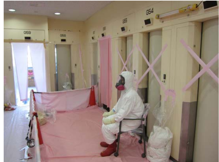
Date of photo : May 19, 2011 around 2:00PM Place :Doorway in front of Rest Area