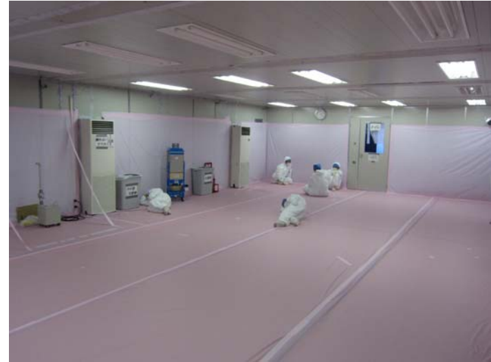
Date of photo : May 19, 2011 around 1:00PM Place :Inside Rest Area