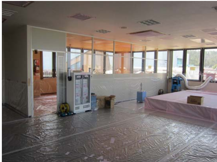
Date of photo : May 19, 2011 around 2:00PM Place :Inside Rest Area