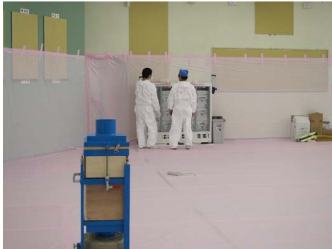
Photo : June 9, 2011 approx. 3:00PM Place : Inside Rest Area (Local exhauster is in front)