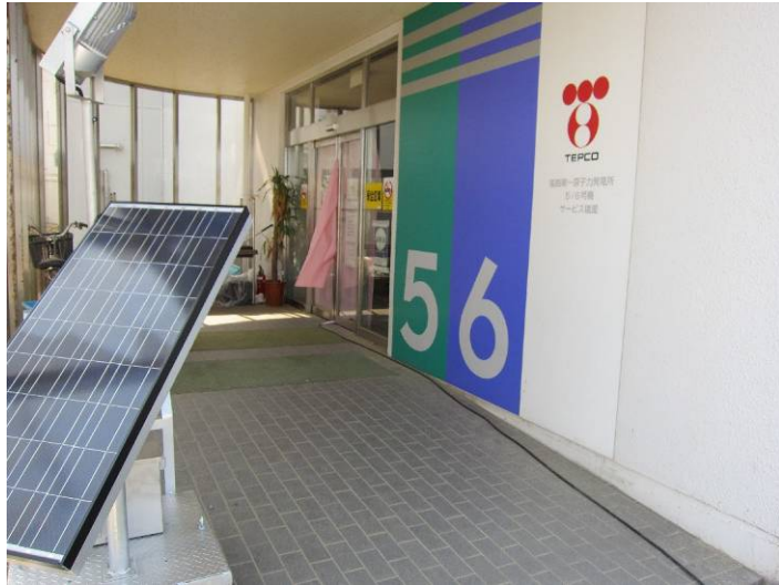
Date of photo : May 19, 2011 around 2:00PM Place :Near doorway of 5/6 Service Building