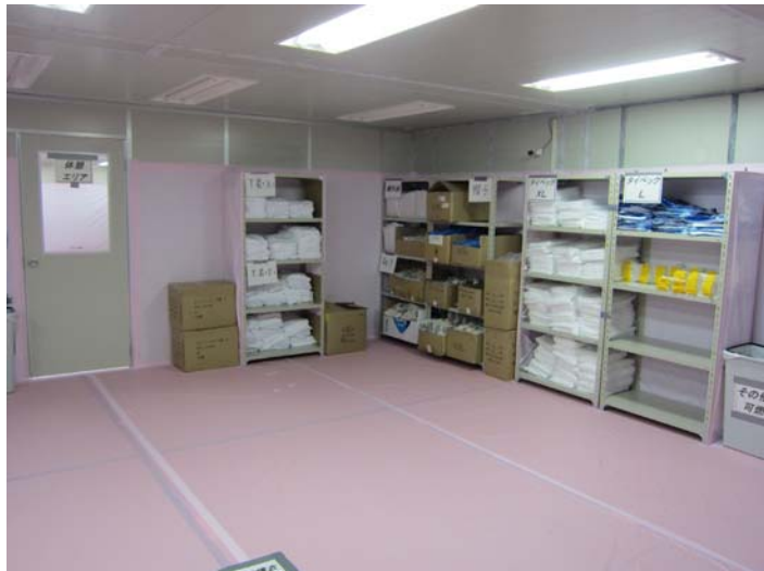
Date of photo : May 19, 2011 around 1:00PM Place :Extra clothes (Protective clothing, Under wears) in Rest Area, storage space