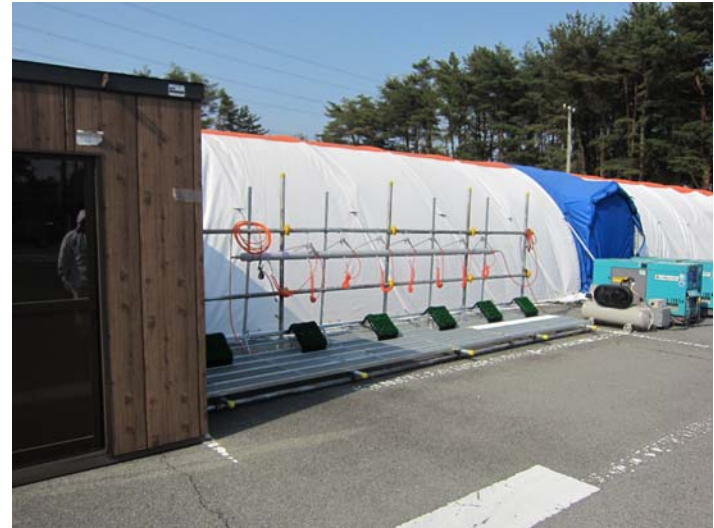
Photo : May 15, 2011 around 11:00AM Place : Wiping Feet Place in front of Rest Area