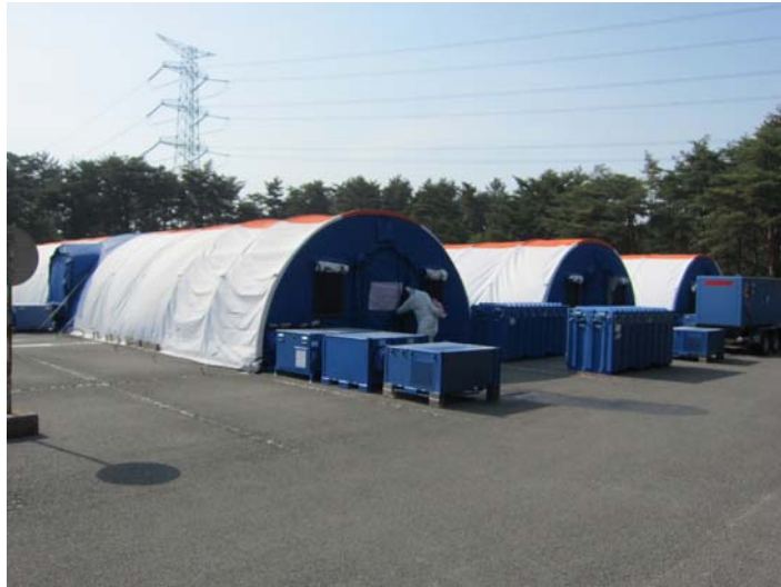
Photo : May 15, 2011 around 11:00AM Place : Appearance of Rest Area