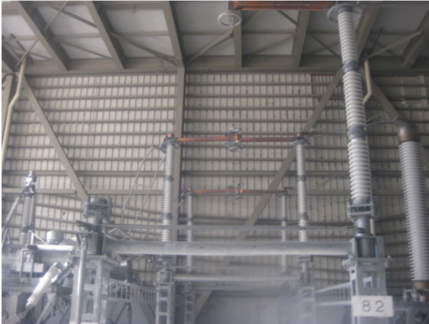
March 23rd 2011