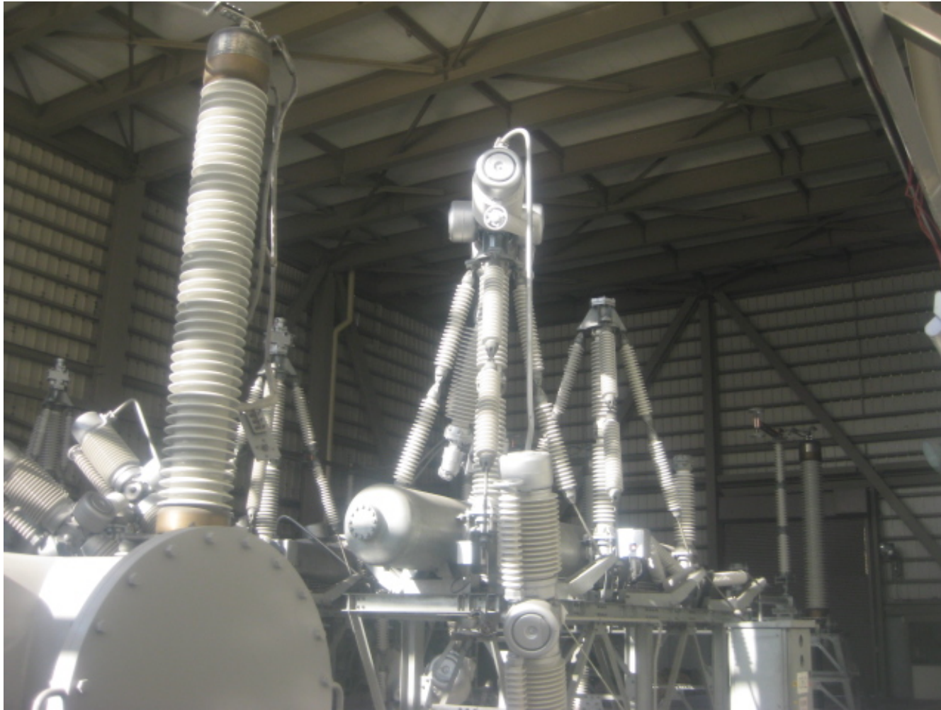
March 23rd 2011