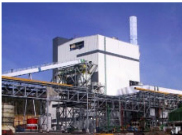
Nueva Aldea Biomass Power Plant

Biomass cogeneration system whose total capacity is 30,000 kilowatts × 2 units