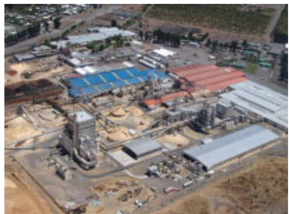
Trupan Biomass Power Plant