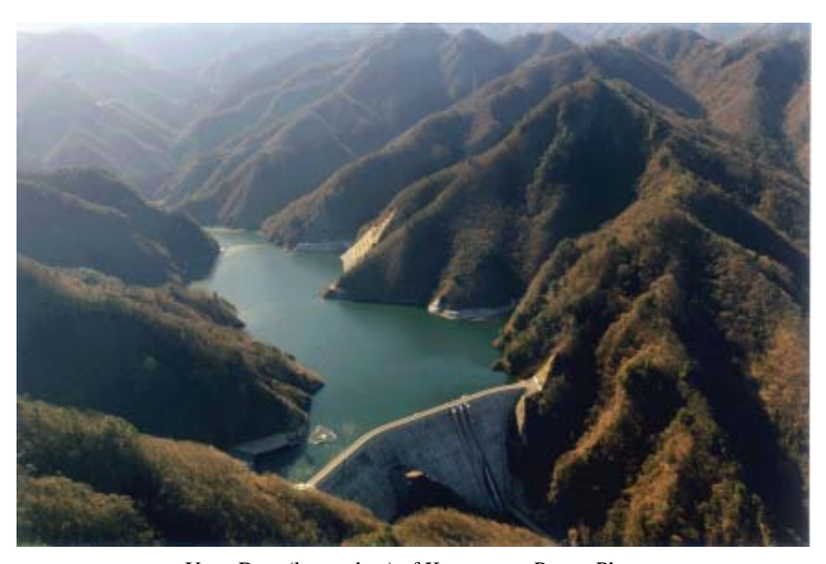
Ueno Dam (lower dam) of Kannagawa Power Plant