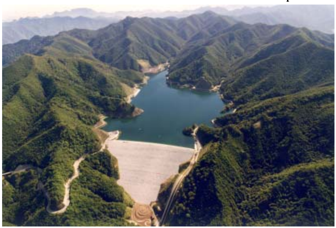
Minamiaiki Dam (upper dam) of Kannagawa Power Plant