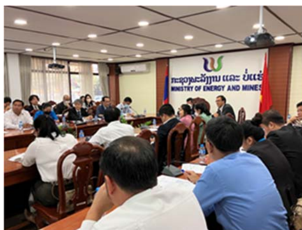
Start of on-site activities