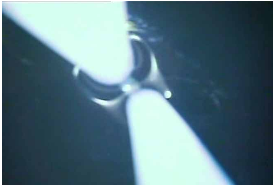
1. Reached water surface

Time: From around 10:00AM to around 0:45PM