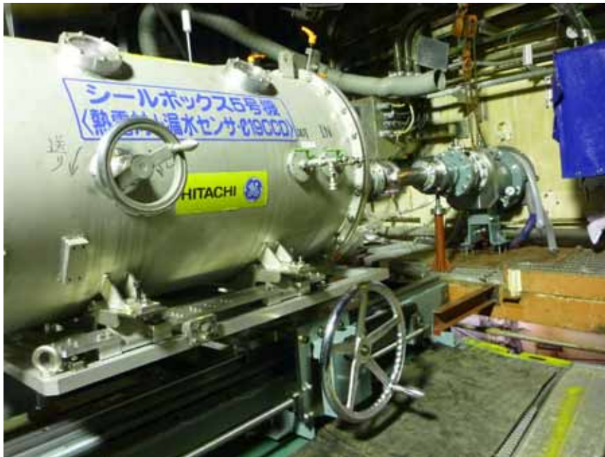
3. the permanent monitoring system (sealed box)