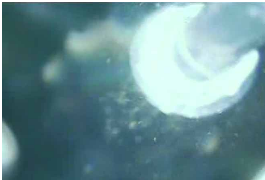
7.Reached water surface

Time: From around 9:00AM to around 1:30PM