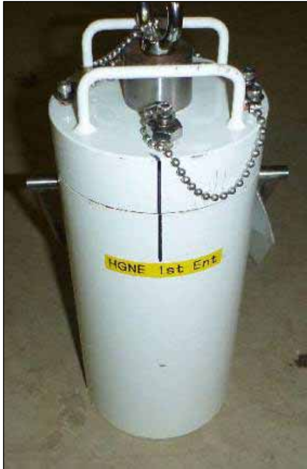
5. Radiation shield case