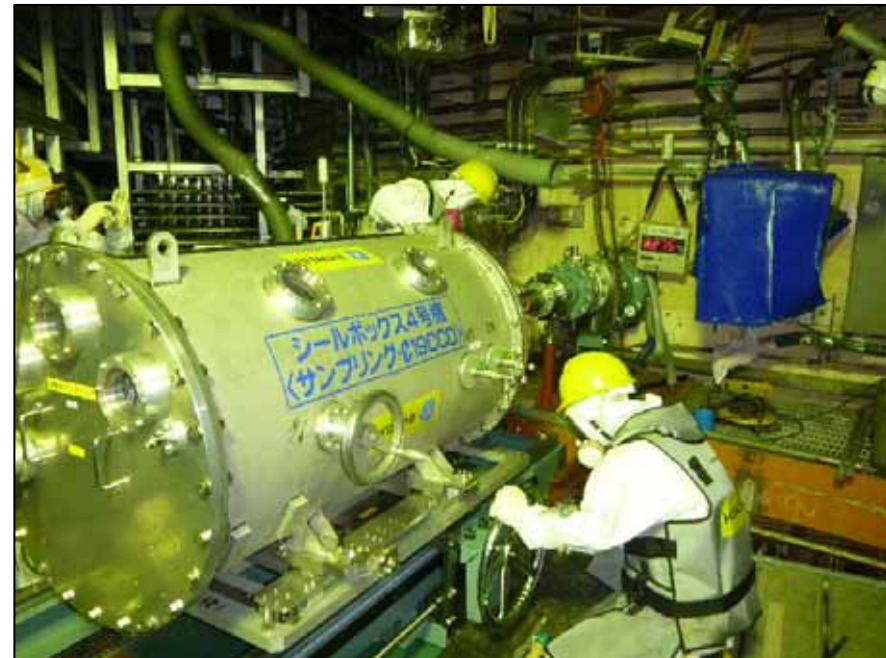
4. Collecting samples work

Photos taken on October 12, 13, 2012 by TEPCO