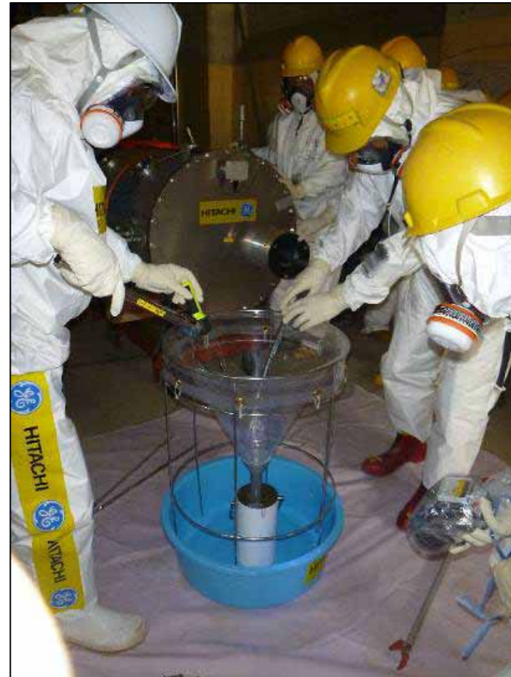
6. Transfer samples to radiation shield case

Photos taken on October 12, 2012 by TEPCO