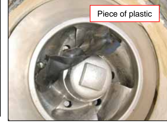
Pump main body (Photo taken after removing the suction part from the pump)