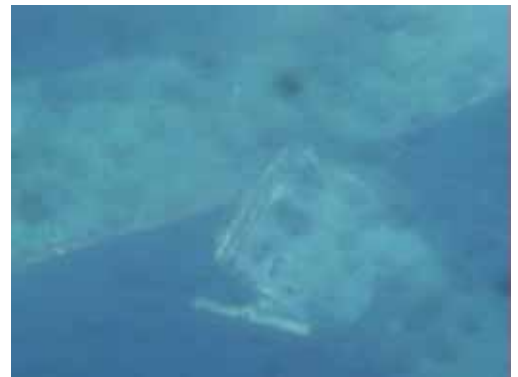
Tip of the H-steel investigated and other H-steel

Confirmed no damage on the fuel assembly and the fuel storage rack in the area near the steel beam investigated on September 24.