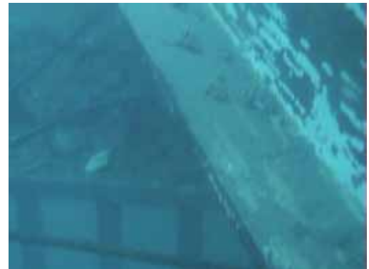
Part of the H-steel investigated and fuel storage rack