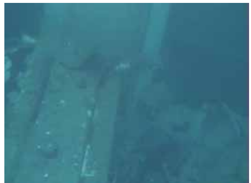
Jib crane and the tip of the H-steel investigated