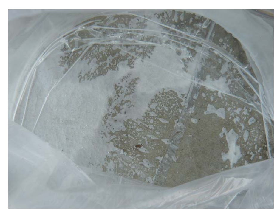
View from the above

Photos taken on September 10, 2012