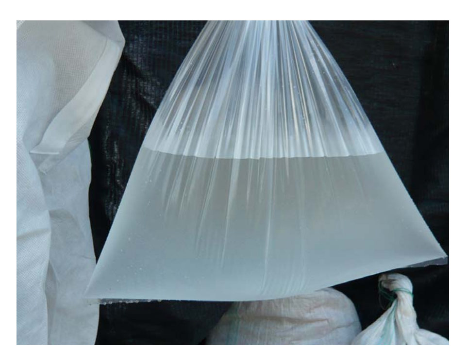
Buffer tank water