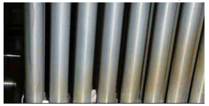
1. First unused fuel (Rust attached on the surface) (Photo taken on August 28, 2012)

was inspected while it was being cleaned.