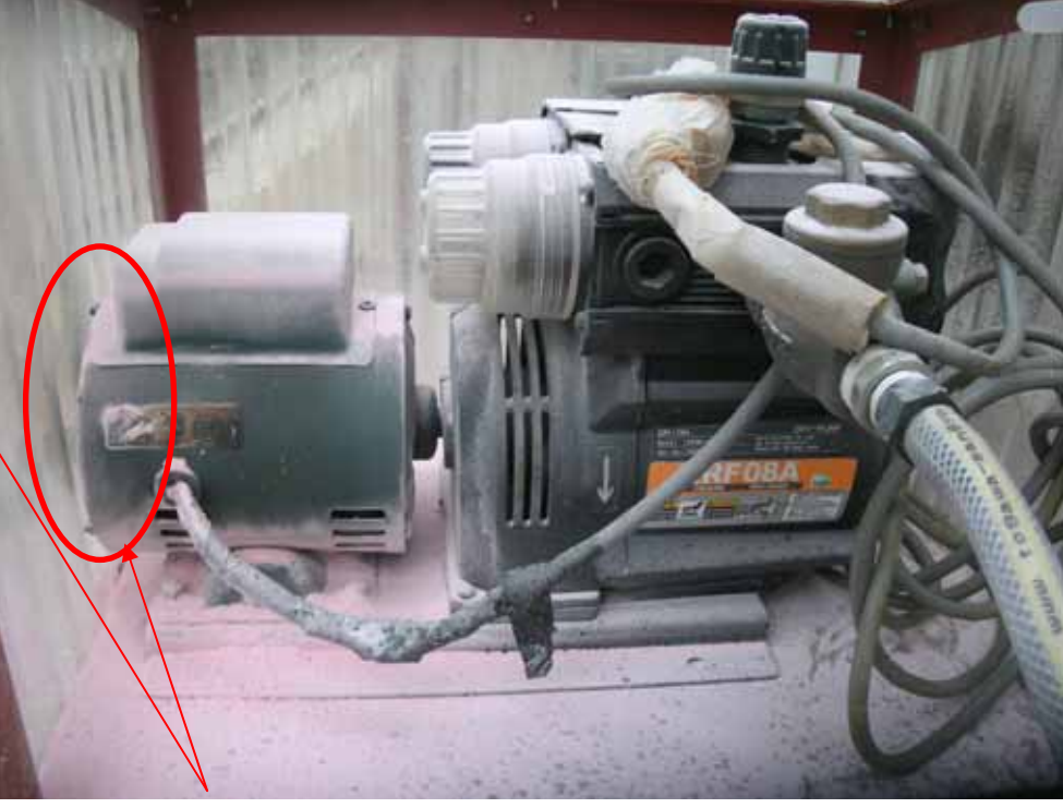
Areas where white smoke came out

The motor of the pump from which white smoke came out