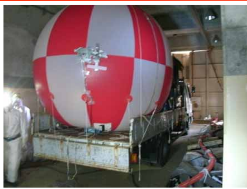
Balloon loaded on the truck