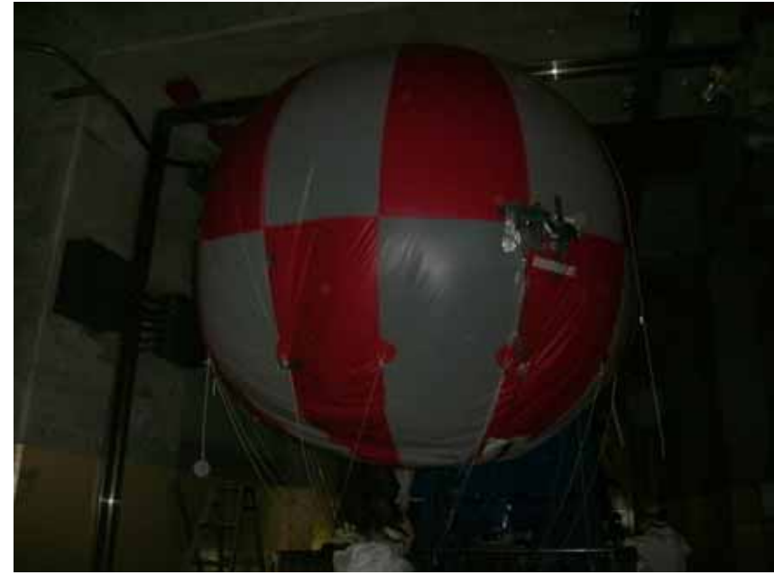
Appearance of the balloon