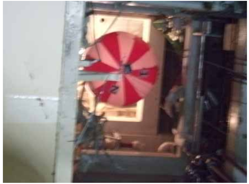
Balloon floating inside the hatch shaft (Photo taken from straight below the balloon)