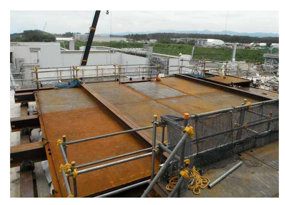
Protection platform installation on the Spent Fuel Pool Photo taken on June 15, 2012

• Large equipments left on the operating floor (PCV, RPV lid etc.) will be removed from late July to October 2012. Cover installation for fuel removal is also scheduled.