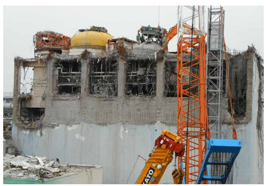
After debris removal (Upper part of the operating floor, west surface) Photo taken on July 9, 2012