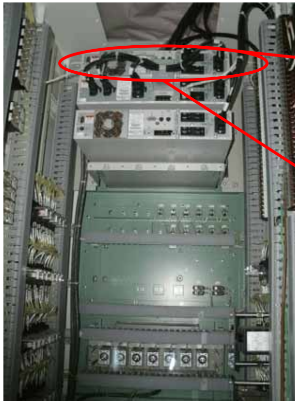
Control panel (Back)