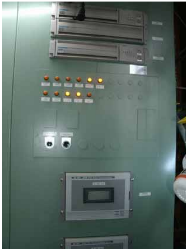
Control panel (Front)

UPS: Uninterruptible power (-supply) system