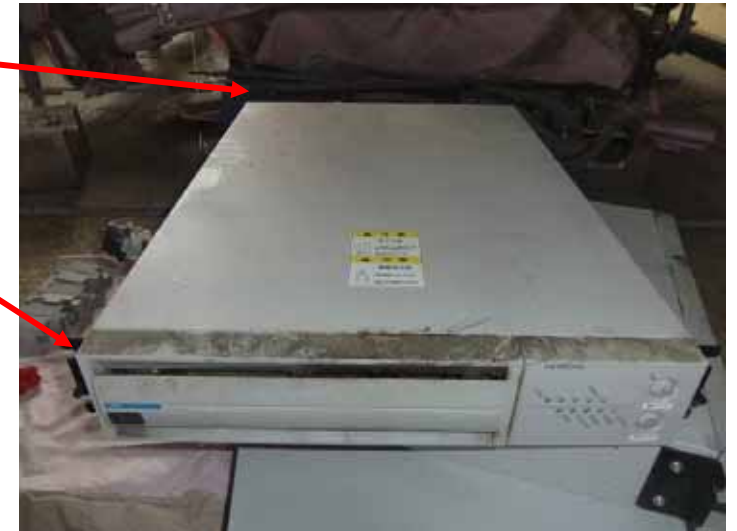
Removed (failed) UPS

No damage found on the front and the back of the control panel.