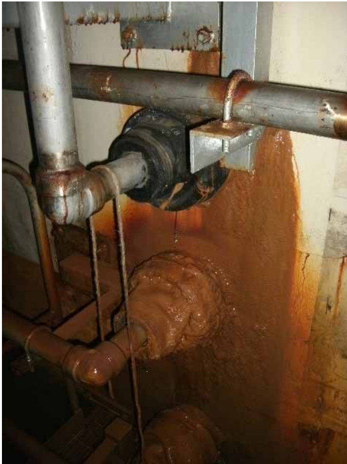
1. Water flowing in from where the pipe penetrates through the wall