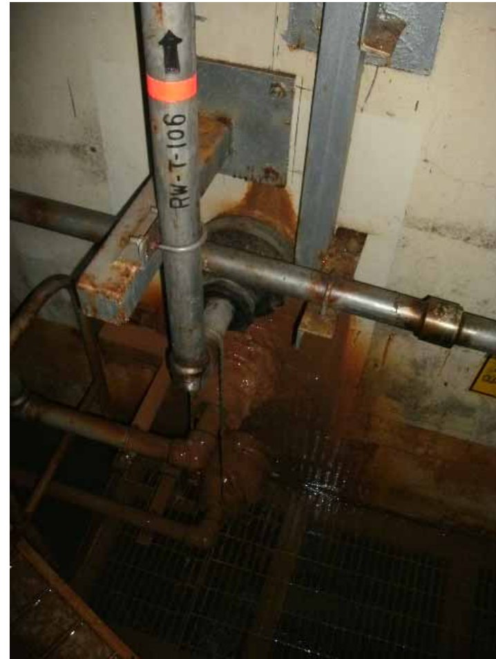
2. Accumulated water