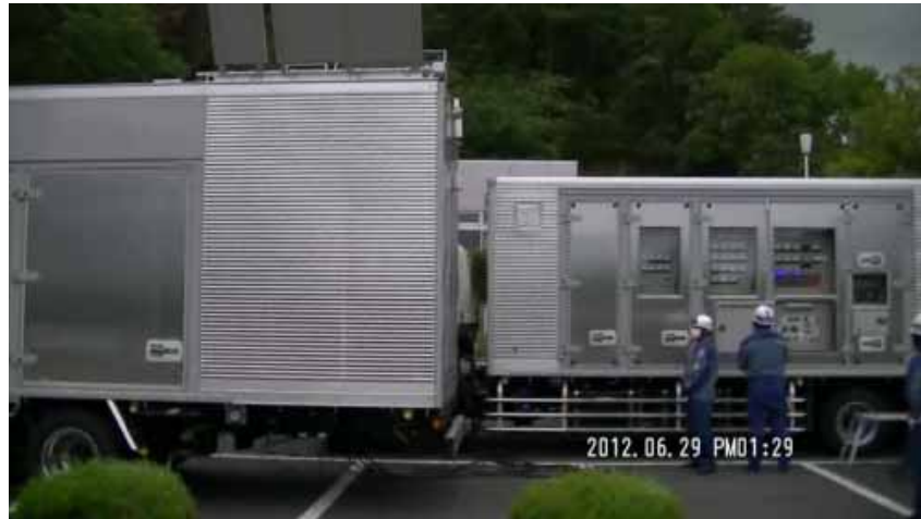
1. Air-cooled gas turbine power supply car (left) and control vehicle (right)