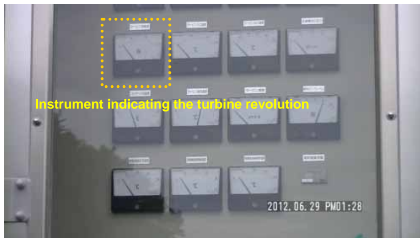
3. Control panel of the control vehicle (Instrument indicating the turbine revolution)