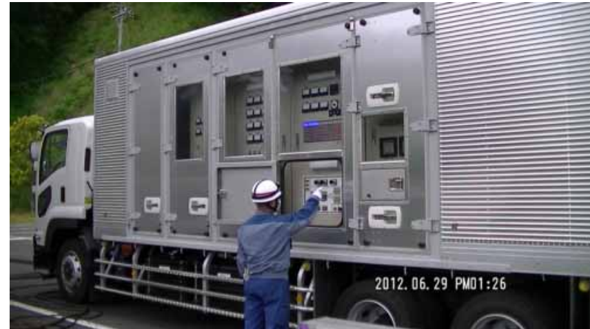
2. Control vehicle (Start-up operation)