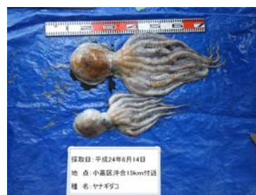
8. Chestnut octopus