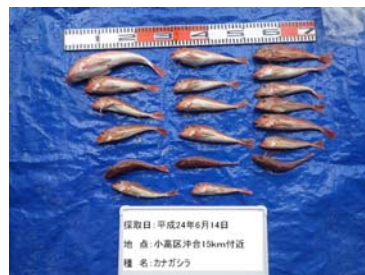
2. Lepidotrigla microptera