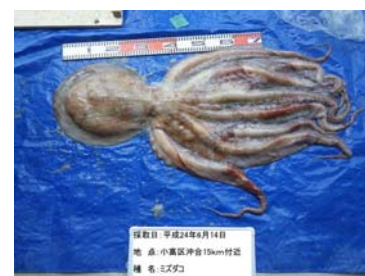
7. Octopus (Enteroctopus) dofleini