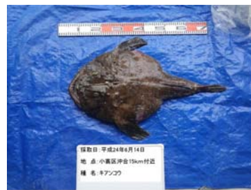
3. Lophius litilon