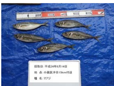
6. Common horse mackerel