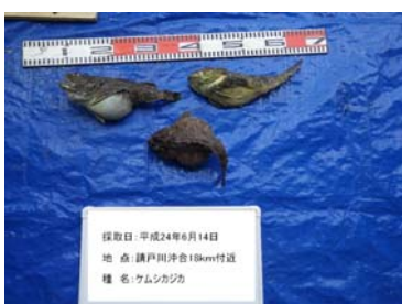
11. Littlemouth flounder