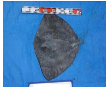
8. Dasyatis matsubarai