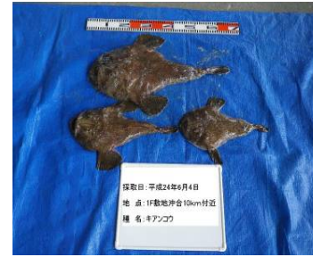
4. Lophius litilon