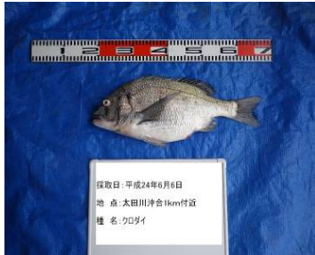
16. Acanthopagrus schlegelii