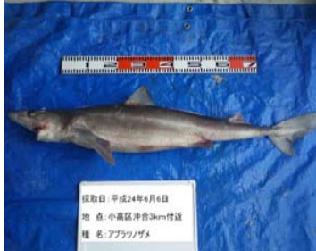
21. Northern dogfish