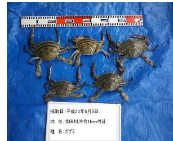
14. Blue crab