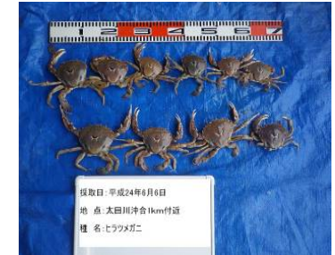
20. Ovalipes punctatus