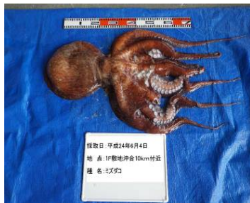
11. Octopus (Enteroctopus) dofleini