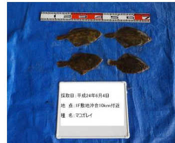
9. Marbled sole