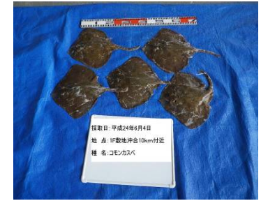
5. Common Skete