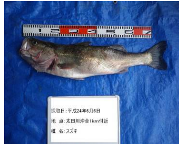
17. Sea bass