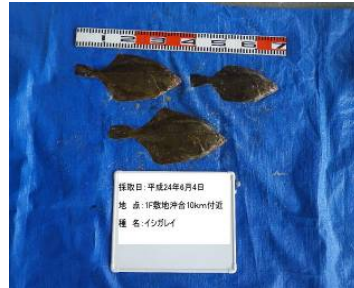
2. Stone flounder