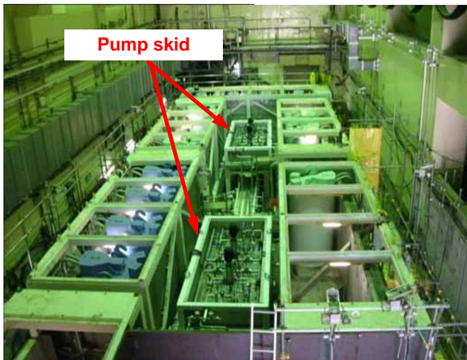
1. Cesium Absorption Apparatus (Full View)