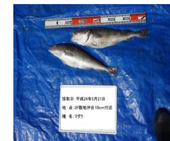
10. Pacific cod