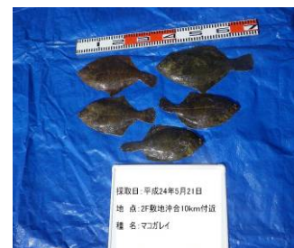
9. Marbled sole