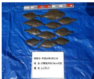
12. Roundnose flounder