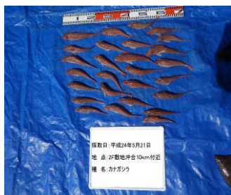
2. Lepidotrigla microptera