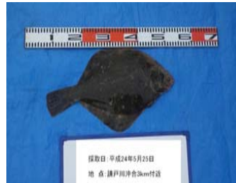
17. Barfin flounder