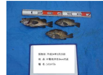
20. Sebastes cheni