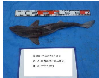
18. Northern dogfish