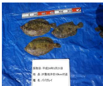
7. Microstomus achne