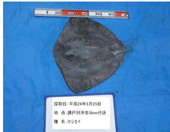
16. Dasyatis matsubarae