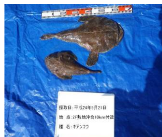
3. Lophius litilon