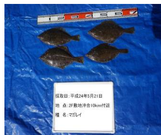
8. Littlemouth flounder