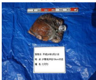
11. Octopus (Enteroctopus dofleini)