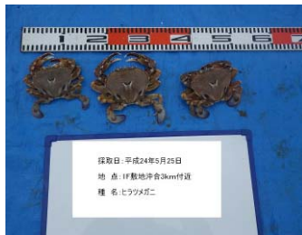
21. Ovalipes punctatus