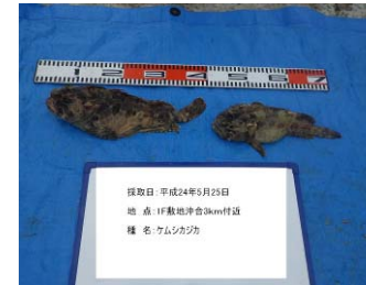
19. Sea raven