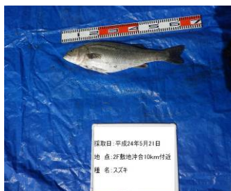
6. Sea bass