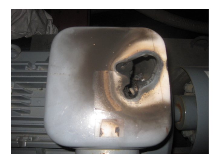
Upper part of the motor terminal