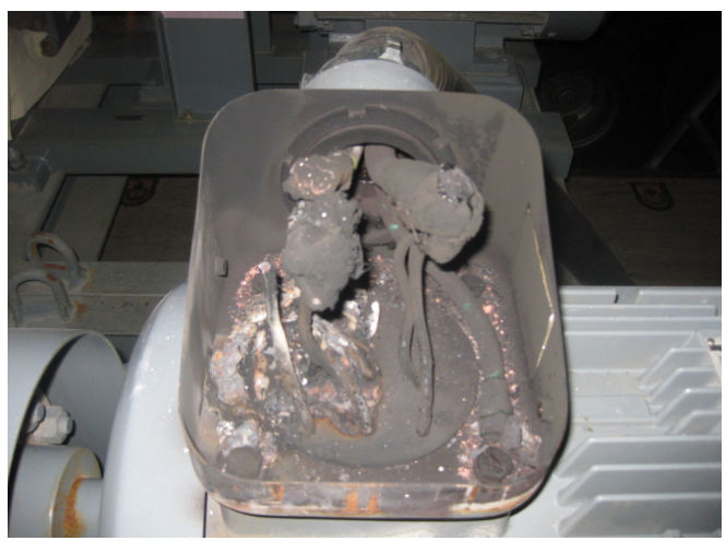
With the motor terminal cover opened