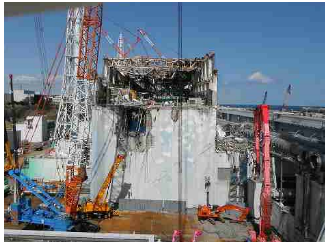
<Full view (South side)> Photo: Mar. 20, 2012

A small heavy machinery set up on Opeflo (Image)