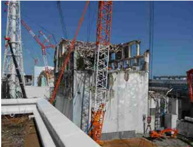
<Full view (South-East side)> Photo: Mar. 20, 2012

Working status of debris removal on the upper side of Reactor Building