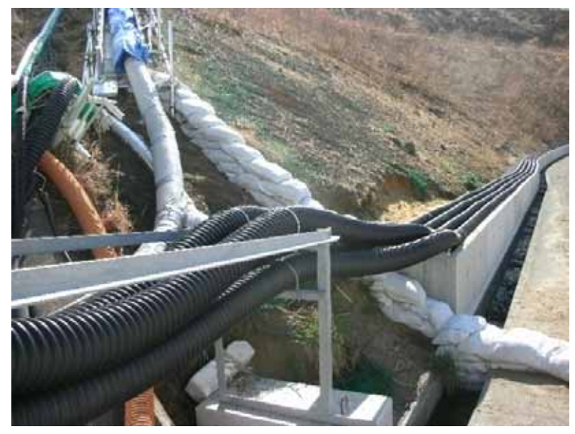
<Sandbags placed on the slope>

<Sandbags placed on the piping which crosses the road>