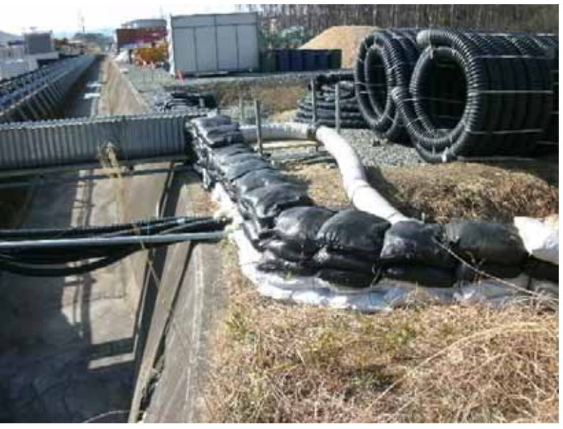
<Sandbags placed around the drainage>