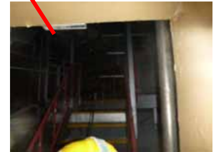
Torus seen from the direction (NW Side)