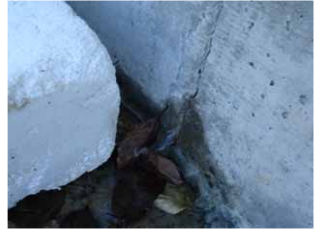
Status of leakage (part 1)