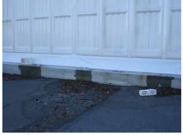
Status of leakage (part 2)