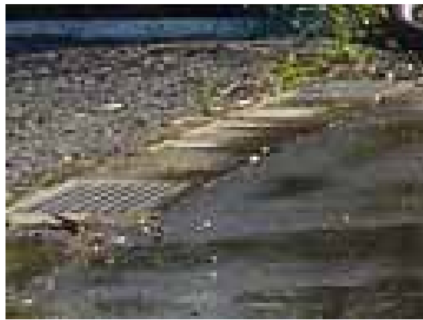
Gutter close to evaporative condensation apparatus Photos taken on December 4, 2011