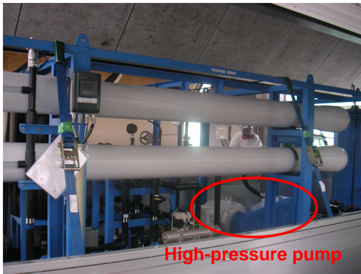
<Reverse osmosis membrane in reverse osmosis membrane unit>