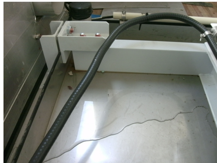
<Status of leakage (before wiping off)>