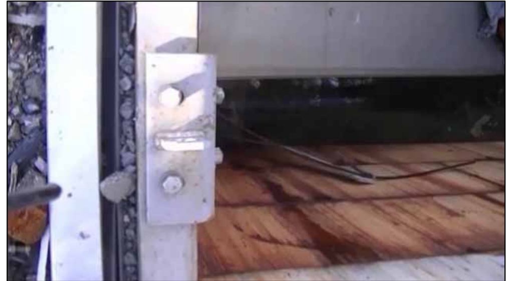
Recording date: October 6, 2011