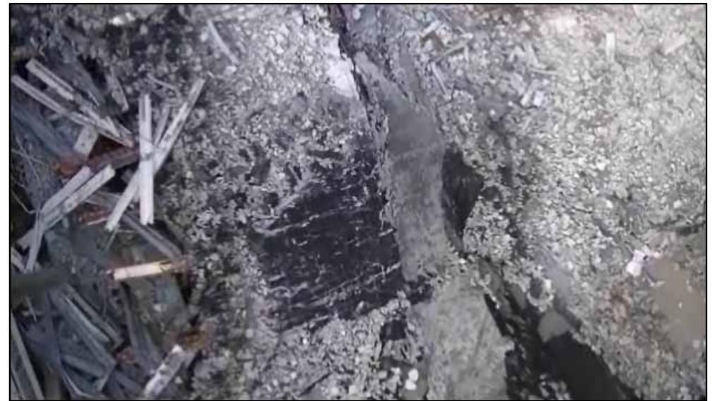
Recording date: October 3, 2011