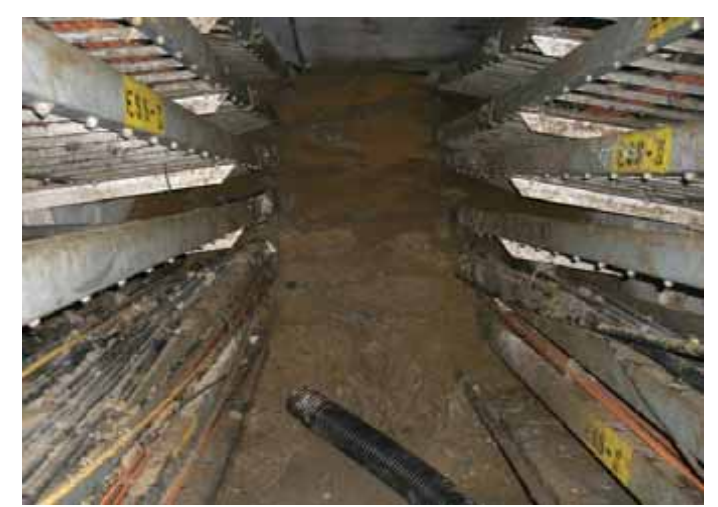
( 29 ) Unit 5 Water intake cable pit Taken by TEPCO employee on August 25,2011