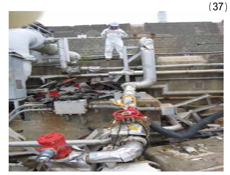
(37) Unit 5 and 6 Extinction pipes Taken by TEPCO employee on August 22,2011 (39)