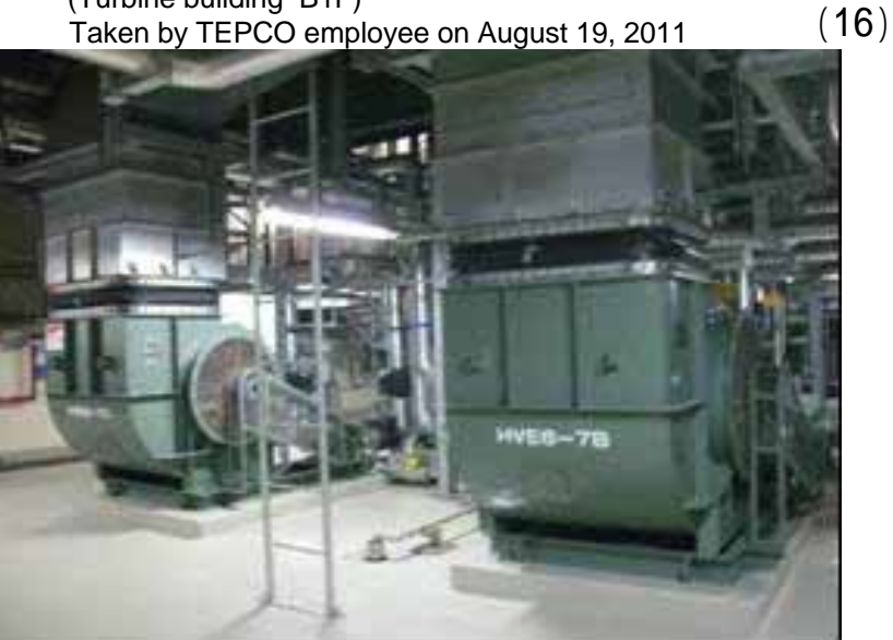
(16) Unit 6 gas treatment System (A)(B) (Reactor building 3F) Taken by TEPCO employee on August 19, 2011

(14) Unit 6 Emergency diesel generator (A) (Turbine building B1F) Taken by TEPCO employee on August 19, 2011