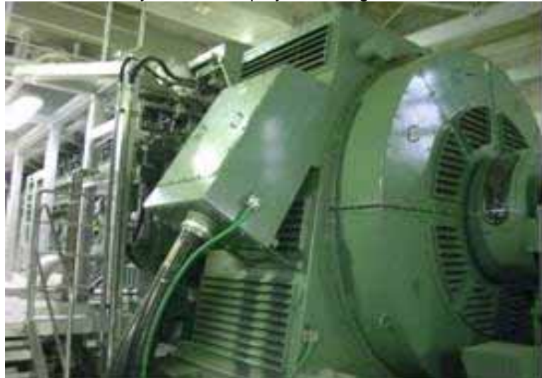
(15) Unit 6 High Pressure Core Spray System diesel generator (Reactor building B1F) Taken by TEPCO employee on August 19, 2011

Taken by TEPCO employee on August 18, 2011 (15)