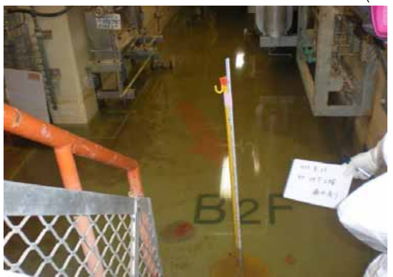
(24) Unit 6 Complex building B2F Taken by TEPCO employee on August 23, 2011