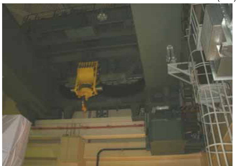
(21) Unit 6 Reactor building ceiling crane on August 24, 2011 (23)