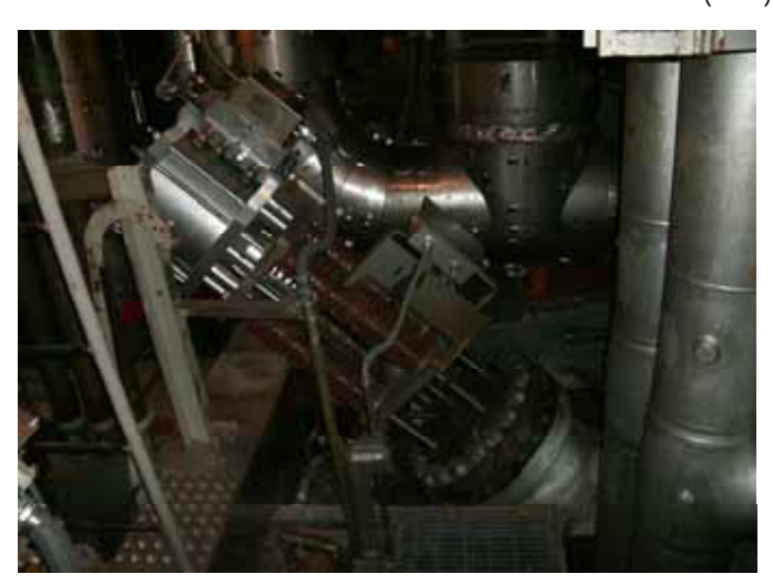
(12) Unit 5 Main steam isolation valve (Primary Containment Vessel 1F) Taken by TEPCO employee on August 17, 2011