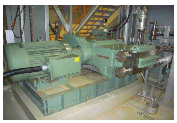
(10) Unit 5 Boric acid injection pump (A) (Reactor building 4F) Taken by TEPCO employee on August 19, 2011