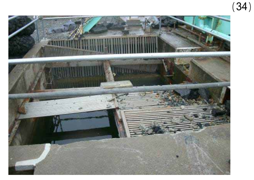
(34) Unit 6 Around screen Taken by TEPCO employee on August 28,2011