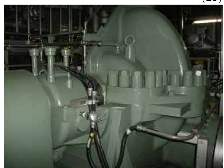
(20) Unit 6 High pressure condensate pump (Turbine building B1F) Taken by TEPCO employee on August 23, 2011