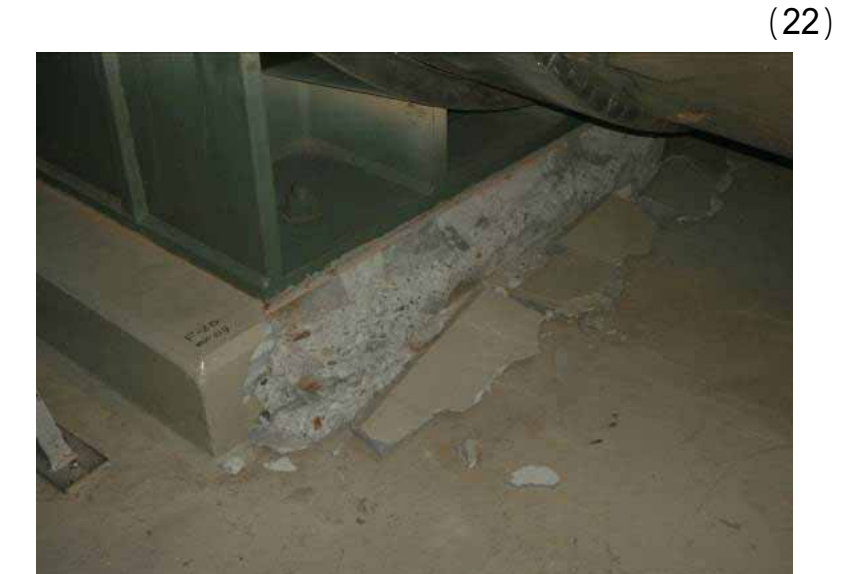
(22) Unit 6 feed water heater (Turbine building 1F) Taken by TEPCO employee on August 25, 2011 (24)