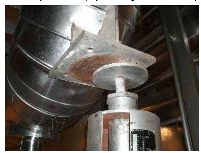
(8) Unit 5 Moisture separator drain pipe support (Turbine building B1F) Taken by TEPCO employee on August 23, 2011