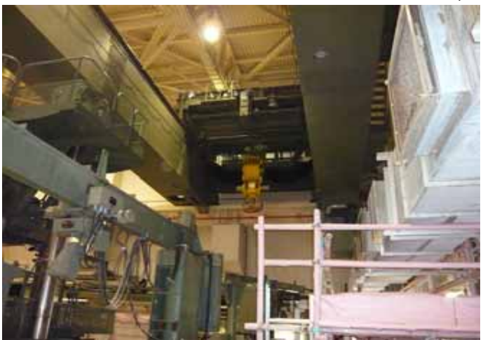
(3) Unit 5 Reactor building ceiling crane Taken by TEPCO employee on August 25, 2011