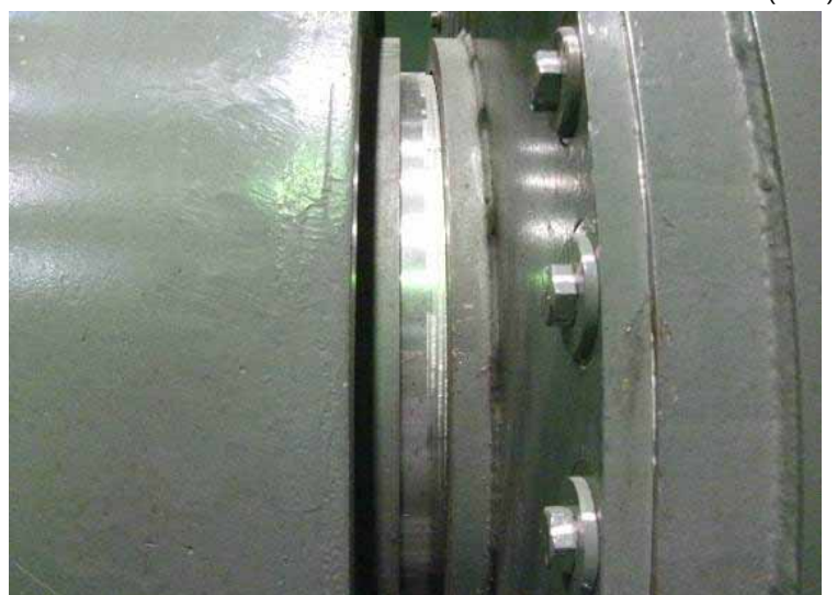
(23) Unit 6 Low pressure turbine (Turbine building 2F) Taken by TEPCO employee on August 23, 2011