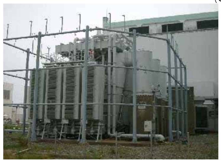
( 36 ) Unit 6 Main transformer Taken by TEPCO employee on August 24,2011