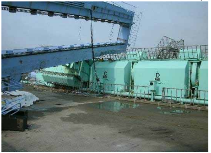
(27) Unit 5 Screen on August 23,2011