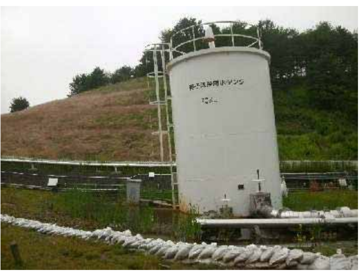
( 32 ) Unit 5 Insulator cleaning tank Taken by TEPCO employee on August 24,2011