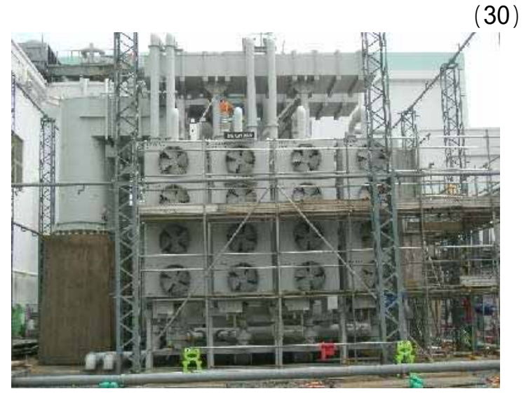
( 30 ) Unit 5 Main transformer Taken by TEPCO employee on August 24,2011 (32)