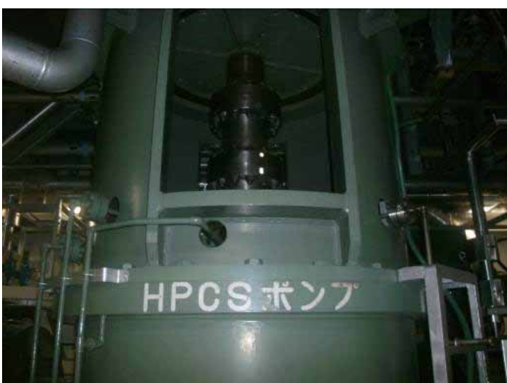
(18) Unit 6 High Pressure Core Spray System pump (Reactor building B2F) Taken by TEPCO employee on August 18, 2011 (20)