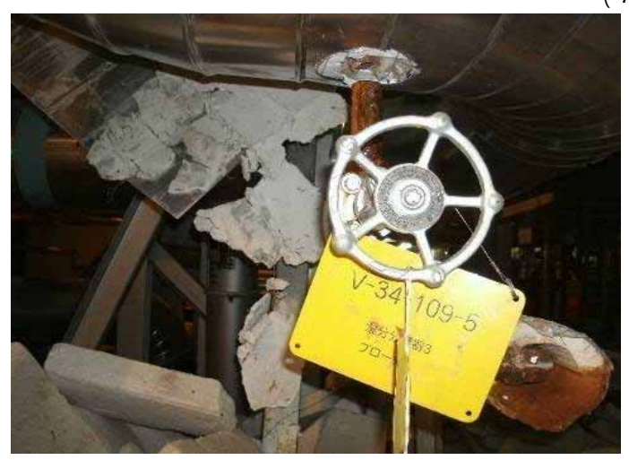
(7) Unit 5 Moisture seperator(3) (Turbine building B1F) Taken by TEPCO employee on August 23, 2011