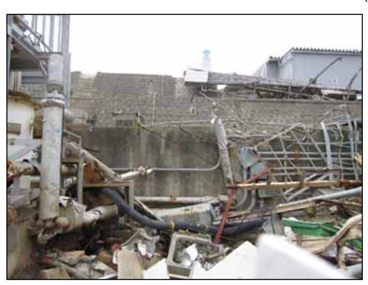
(38) Unit 5 and 6 Extinction pipes Taken by TEPCO employee on August 22,2011