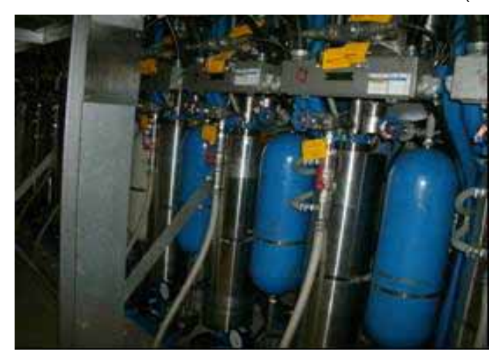
(11) Unit 5 Control rod water pressure control unit (Reactor building 1F) Taken by TEPCO employee on August 19, 2011