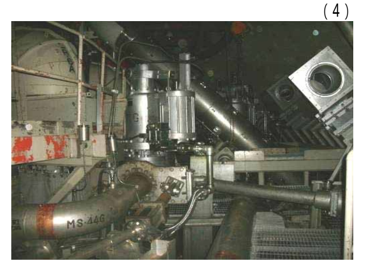
(4) Condition at Unit 5 Primary Containment Vessel 2F Taken by TEPCO employee on August 17, 2011