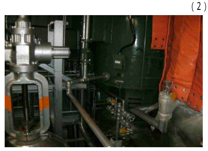
(2) Unit 5 residual heat removal system (RHR) pump (B)(D) (Reactor building B2F) Taken by TEPCO employee on August 26, 2011