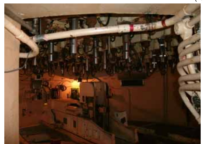
(5) Inside Unit 5 pedestal (reactor foundation) Taken by TEPCO employee on August 17, 2011 (7)