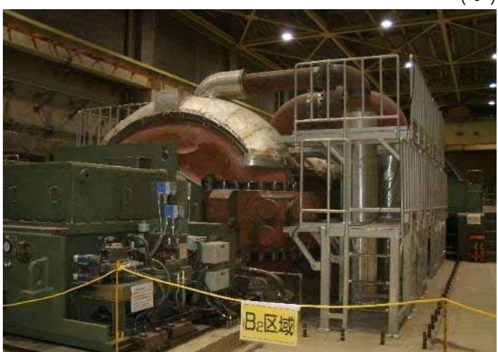
(9) Unit 5 High pressure turbine (Turbine building 2F) Taken by TEPCO employee on August 23, 2011