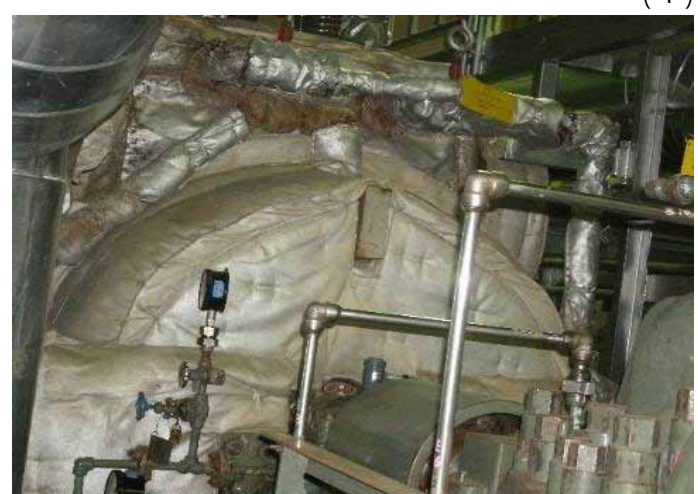
(1) Unit 5 High Pressure Coolant Injection System turbine (Reactor building B2F) Taken by TEPCO employee on August 24, 2011 (3)