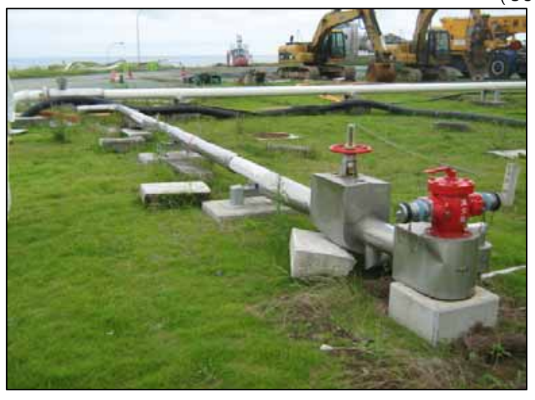
(38) Unit 5 and 6 Extinction pipes Taken by TEPCO employee on August 22,2011