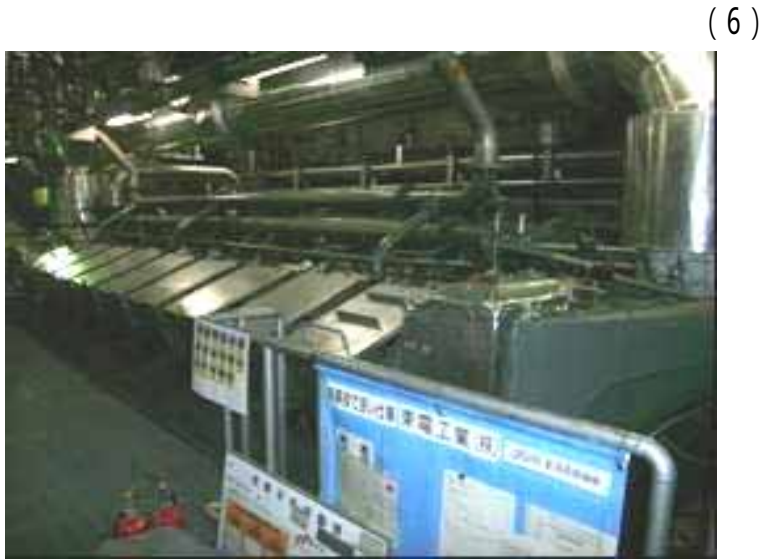
(6) Unit 5 Emergency diesel generator (Turbine building B1F) Taken by TEPCO employee on August 19, 2011 (8)