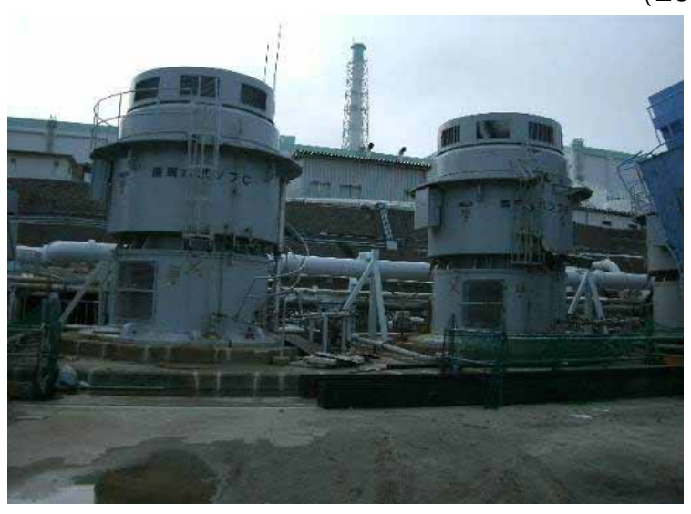
( 26 ) Unit 5 Circulating water pump (B)(C) Taken by TEPCO employee on August 23,2011 (28)