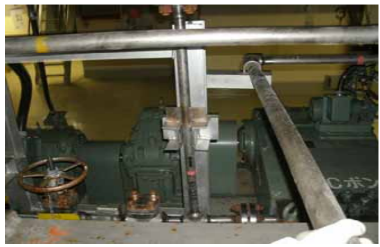
(19) Unit 6 Boric acid injection pump (A) (Reactor building 5F) Taken by TEPCO employee on August 24, 2011