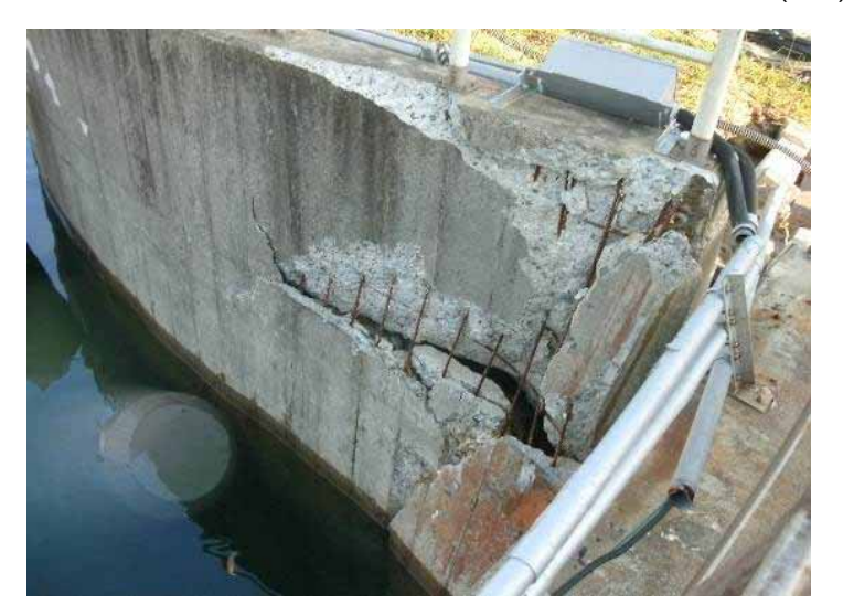
( 25 ) Unit 5 Intake channel Taken by TEPCO employee on August 23,2011