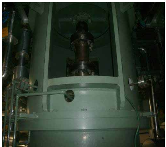
(17) Unit 6 Low Pressure Core Spray System pump (Reactor building B2F) Taken by TEPCO employee on August 18, 2011 (19)