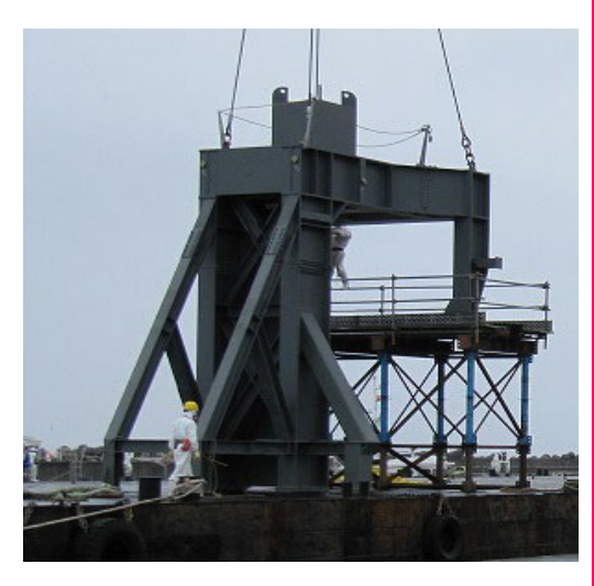
Unloading of iron framework (Jul 26, 2011)