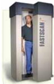
[Authority] Canberra Japan KK HP