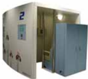
[Authority] Fuji Electric Co., Ltd HP