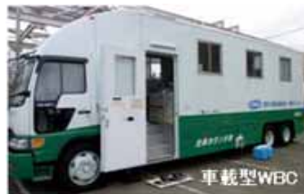
[Authority] Japan Atomic Energy Agency HP