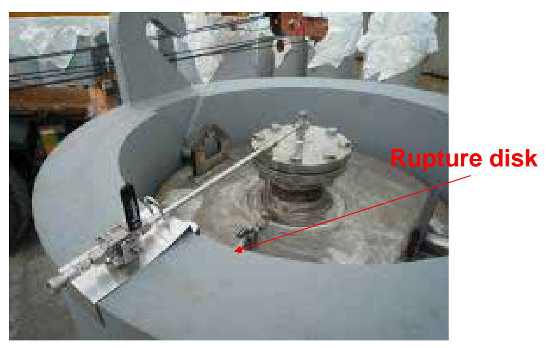
Rupture disk of cesium adsorption Instruments' vessel manufactured by Kurion Date: May 23, 2011