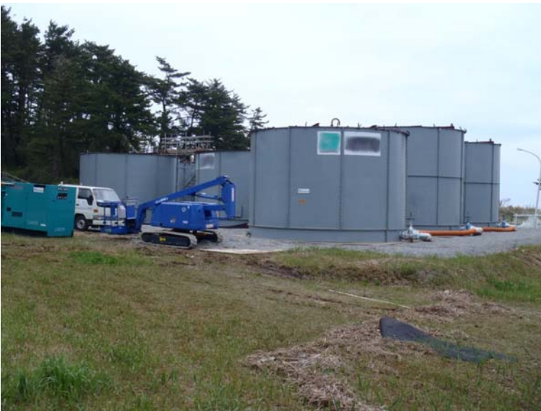
Date/Time : around 10:30 May 11, 2011 Location : Storage Area(North Side) ② round-shaped tank (reference: Layout)