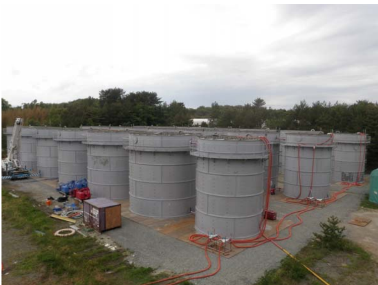
Date/Time : around 15:00 May 27, 2011 Location : Storage Area(North Side) ③ round-shaped tank (reference: Layout )