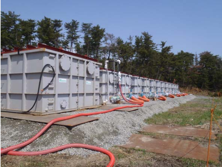
Date/Time : around 9:30 May 4, 2011 Location : Storage Area(North Side) ① square-shaped tank (reference: Layout plan )