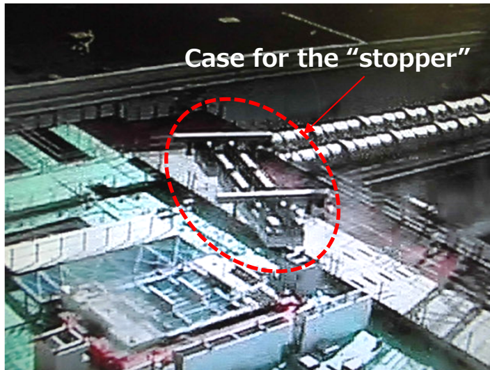
Case for the “stopper” lifted up