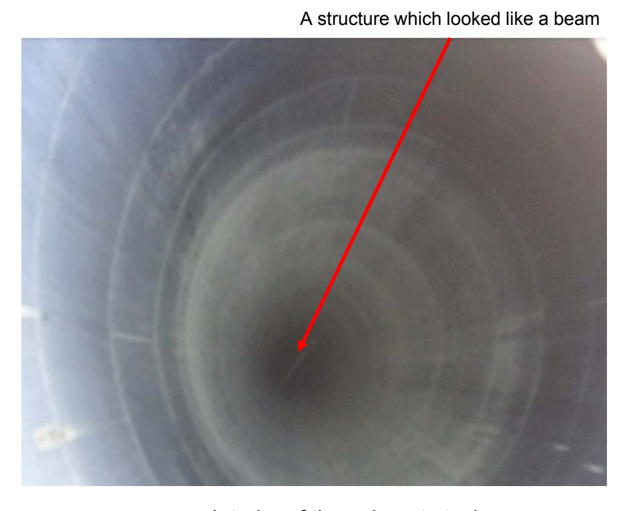
Interior of the exhaust stack