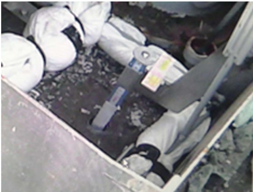
Water level measurement