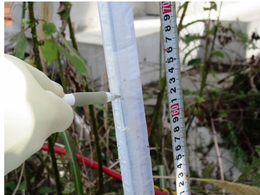
Measurement results (Approx. 60cm)