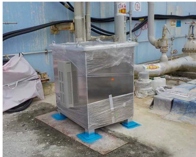
Installation of muon-measuring equipment (downsized to approx. 1m × 1m × 1.3m(height))