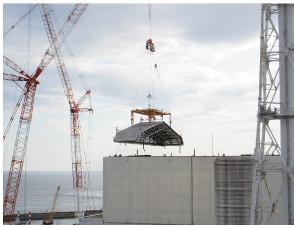
View from the Vicinity of the Building