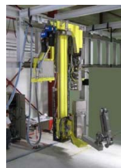
Remotely controlled device