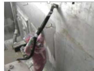
Decontamination using gel