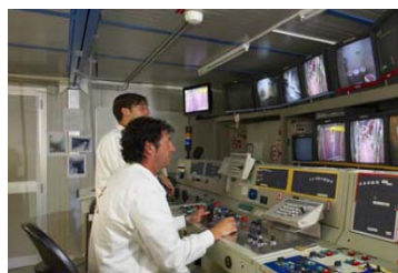
Decommissioning remote control room