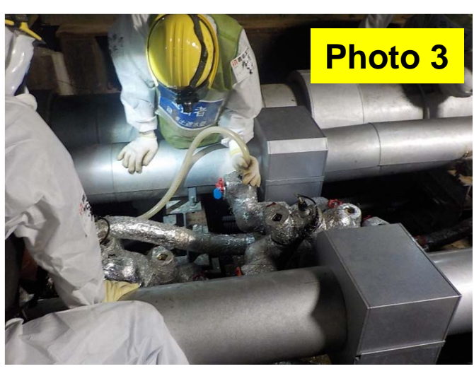
Photos taken on September 3, 2015