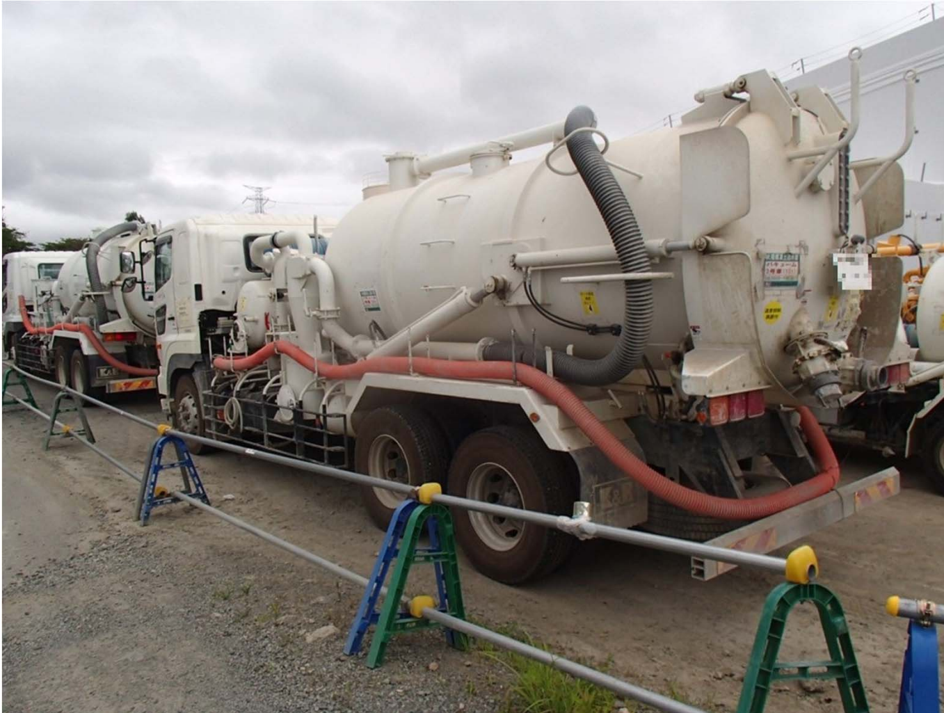
Construction vehicle of the same model