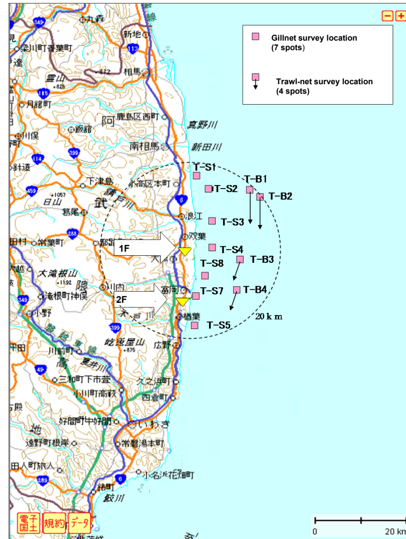
Figure 3: Survey locations for fish and seashells (Mar. 2015)

○ For the time being, these sampling/measurement activities are conducted on a monthly basis at the eleven sampling spots. (sampling may be ceased due to weather conditions.)